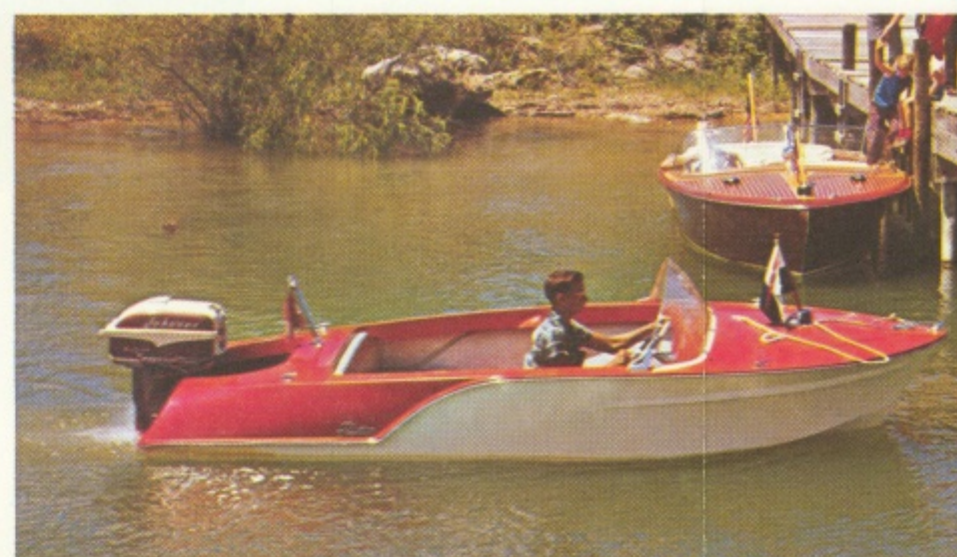
Resort living 19 minutes from downtown Tulsa