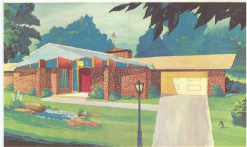
Gracious homes, such as this spacious lakeshore structure, enhance the beauty of the natural landscaping and provide year around resort living only 19 minutes from downtown Tulsa.