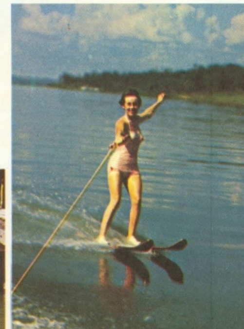
Moderate weather encourages water sports the year around.