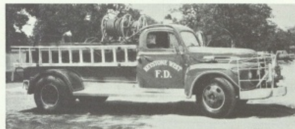
Our Own Fire Protection

At Keystone West Lake Estates, your real estate is evaluated at a low 10 percent of the replacement value. Deduct your $1000 homestead exemption. Even then assessment here is only $33.40 per thousand.