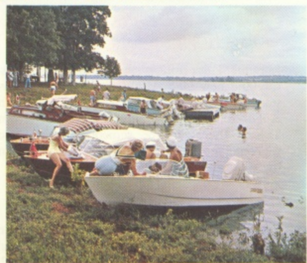
Boating means more fun for the entire family, and the new Keystone Lake offers abundant opportunity for the boat enthusiast.