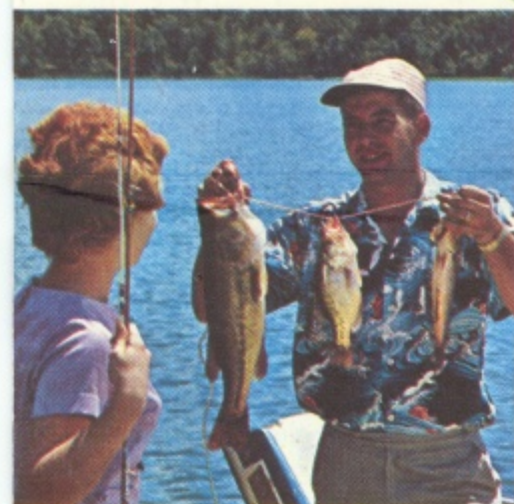
Fishing and water sports make leisure time more enjoyable at Keystone West Lake Estates